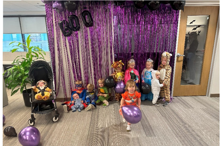
Legacy Trust employees and their children enjoy a costume party, spooky games, and candy at our annual Halloween Party; November 2022.

U.S.-China relations have remained an ongoing disruption that has come in and out of the foreground. The U.S. provided increased military and economic support to Taiwan while China demonstrates an ongoing willingness to pressure Taiwan. With tensions running high, President Biden and Chinese leader Xi Jinping plan to meet in November at the Asia-Pacific Economic Cooperation summit in San Francisco.